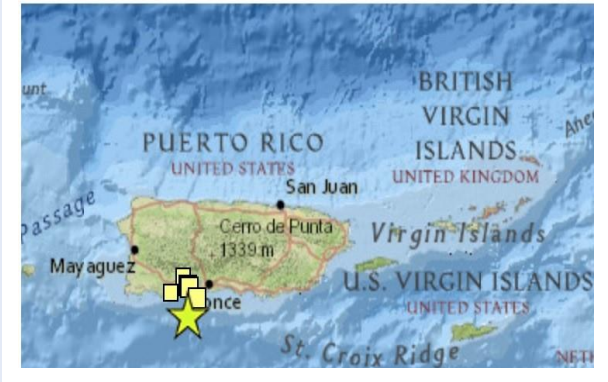
Seismic Activity to the South of Puerto Rico, January 7, 2020. [PRSN redsismica dd. Jan 7, 2020]

No watches or warnings of Tsunami surveillance have been issued for Puerto Rico and the Virgin Islands as of 8:00 AM AST on January 8, 2020.